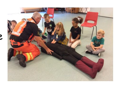
The Air Ambulance visit to 2HF

Year 2 had a visit from the air ambulance crew and some paramedics too. This was to help them learn about the emergency services. The children were taught some vital life-saving skills