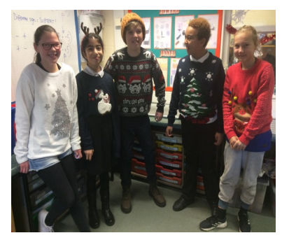
Christmas Jumper Day