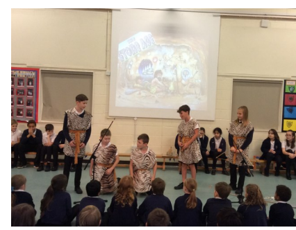
6GB Class Assembly

4KW also performed an assembly. They shared lots of interesting facts about the Ancient Romans. They even mentioned that Roman adults (like adults now) liked an occasional glass of wine!