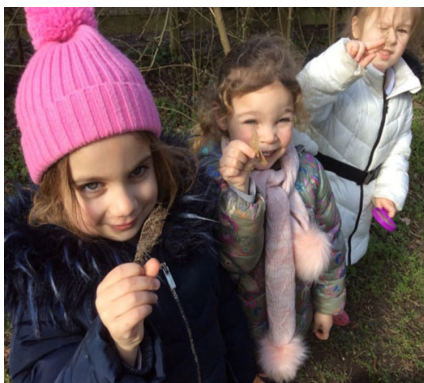
Forest School Fun

In the final week of this term, the lucky children who took part will be visiting the STFC stadium to finish the project by taking part in some football training.