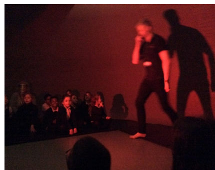
Inside the Explorer Dome

In Key Stage 1, the Explorer Dome came to school. The children got to go inside the dome, which was set up in the New Hall.